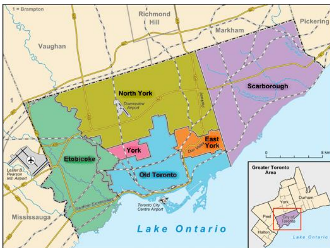
Figure 1: City of Toronto: Map of the pre-amalgamated municipalities, 1967-1997 40